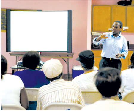
Residents at a Solar One workshop.

Education and training to green your building