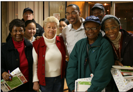
Engaging tenants is key to greening your building.